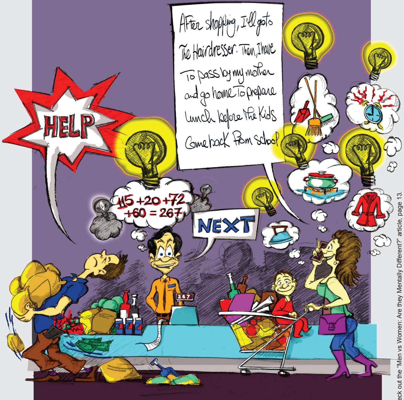
Check out the "Men vs Women: Are they Mentally Different?" article, page 13. Illustrated by: Mohamed Khamis